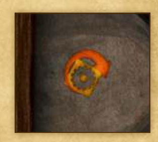
A flip location marked with this symbol can only be explored by a tinkerer or scamp.

This flip location can only be explored when the party has the Fishhook and Thread token available.