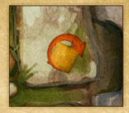
Exploring a Flip Space Flip locations are marked with this symbol:

When a mouse performs an explore action on a flip location, remove the mice from the room tile and flip it over, keeping the arrow on the flip side in the correct orientation. Then place all of the mice on the flip location located on the newly revealed side of the room tile (or an adjacent space if there are more than 4 mice in the party).