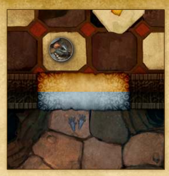
The tile the mouse is on is orange side up. The tile the mouse is moving to must be flipped orange side up.